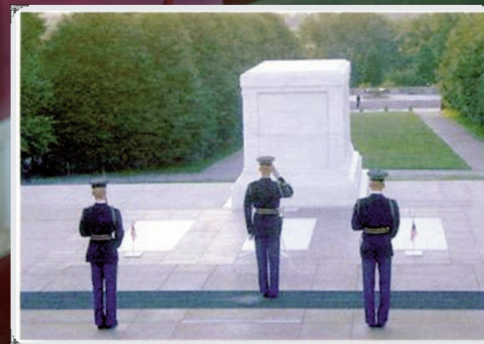
GUARDS AT ATTENTION AT TOMB OF THE UNKNOWN