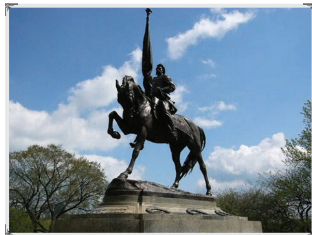
Monument to General John Alexander Logan (1826-1886) in Chicago on Michigan Avenue & 9th Street

Legal Holiday, observed annually on the last Monday in May in most of the United States, in honor of the nation's armed services personnel killed in wartime. The holiday, originally called Decoration Day, is traditionally marked by parades, memorial speeches, patriotic ceremonies and the decoration of graves with flowers and flags, hence the original name. Memorial Day was first observed on May 30, 1868 on the order of General John Alexander Logan for the purpose of decorating the graves of the American Civil War dead. It was observed on May 30th until 1971, when most states changed to a newly established federal schedule of holiday observance.