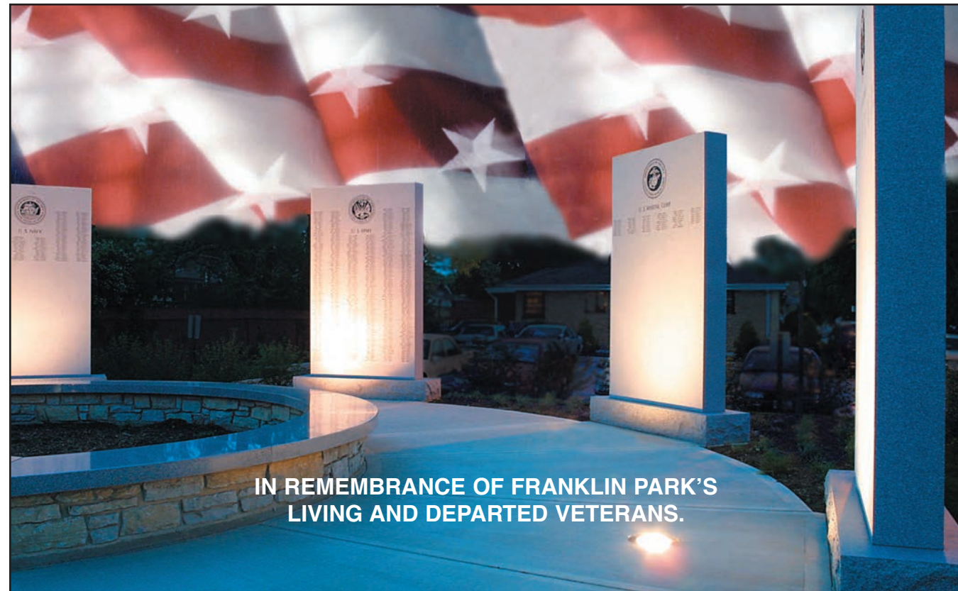
IN REMEMBRANCE OF FRANKLIN PARK'S LIVING AND DEPARTED VETERANS.