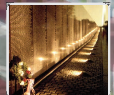
VIETNAM WAR MEMORIAL