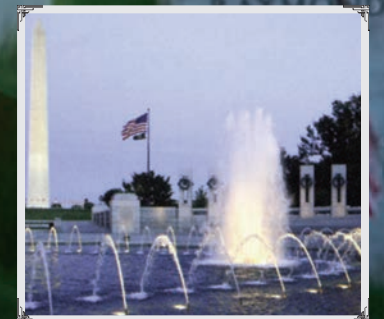
WORLD WAR II MEMORIAL

A Memorial Day Observance Monday, May 27 th , 2013 at 11 AM