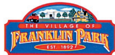
Franklin Park - Veterans Memorial