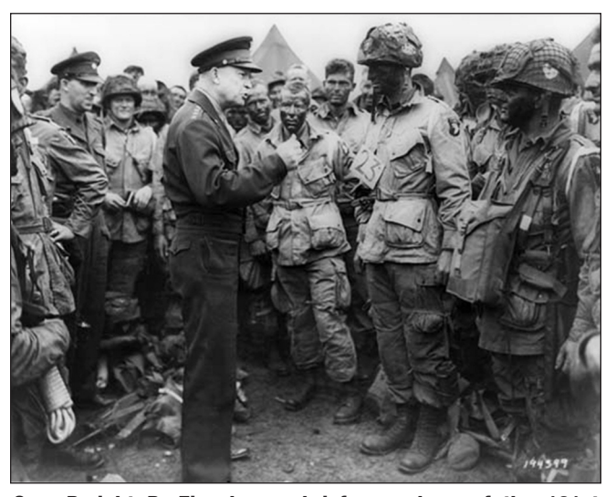
Gen. Dwight D. Eisenhower briefs members of the 101st Airborne Division in the hours just before they were dropped into France as the opening assault of D-Day, 6 June 1944.