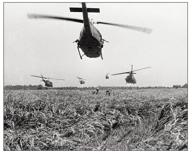
The nine-ship lift was a nine-helicopter-strong formation which transported around 50 men to the field from fire support bases. Here, the first five Hueys in a nine-ship lift have just dropped members of a combat infantry unit near Dau Tieng.