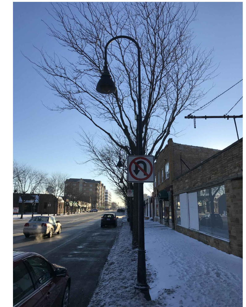
DECORATIVE LIGHT POLE