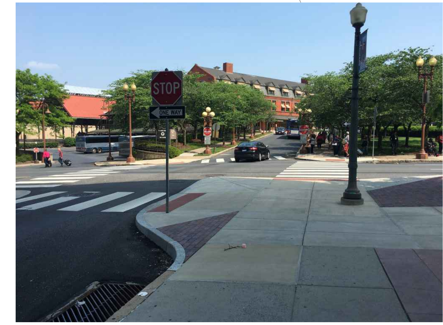
PAVED CURB EXTENSION

DOWNTOWN BEAUTIFICATION - FRANKLIN AVE FROM ROSE ST (25TH AVE) TO EDGINGTON ST FRANKLIN PARK, IL ROSE ST (25TH AVE) TO EDGINGTON ST