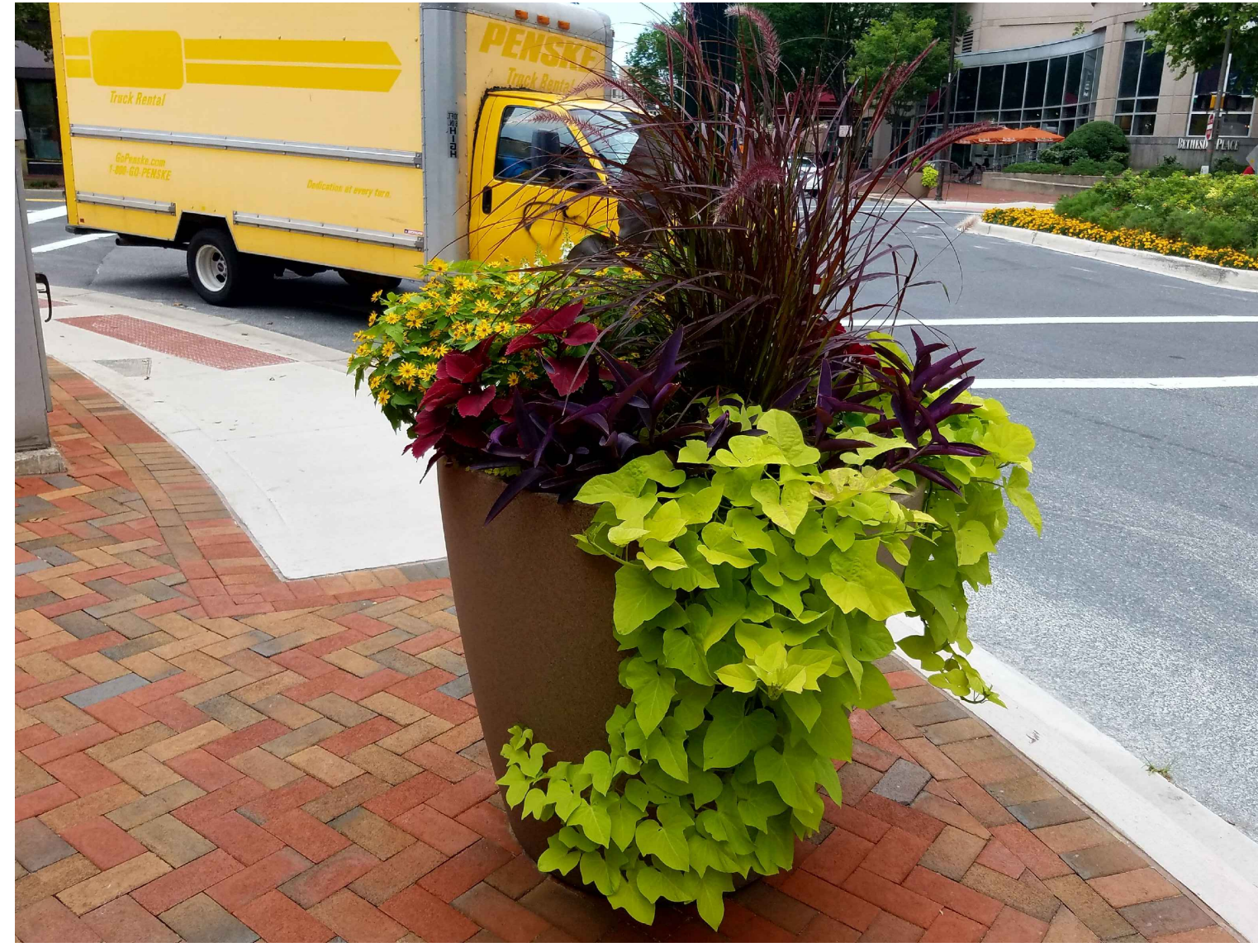
PLANTER WITHIN CURB EXTENSION