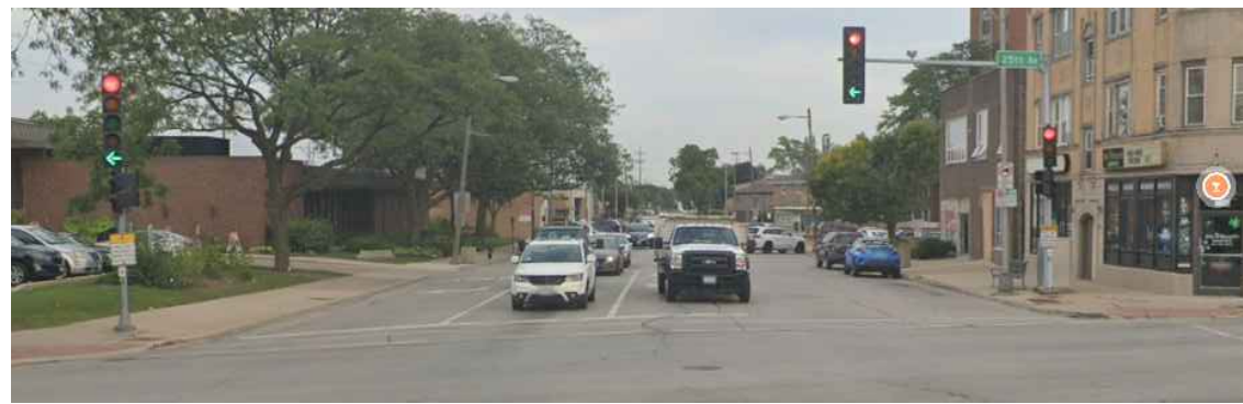
EXISTING STREET CONDITIONS