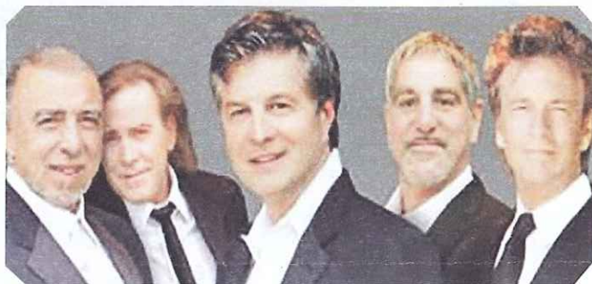
Chicago's very own, "The Buckingham" will perform at 9PM on Saturday, June 11.

Seating is available at all major attractions and areas of Railroad Daze. Visitors are encouraged to bring personal lawn chairs and folding chairs as well. During Railroad Daze, visitors are welcome to park at any legal parking space in a lot or on the street anywhere in the Village. Parking for the disabled is available at the Franklin Park Post Office located at 9760 Franklin Avenue.