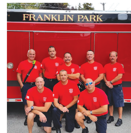
▲ Proceeds from the sale of these red t-shirts go to support Hines VA Hospital's Fisher House.