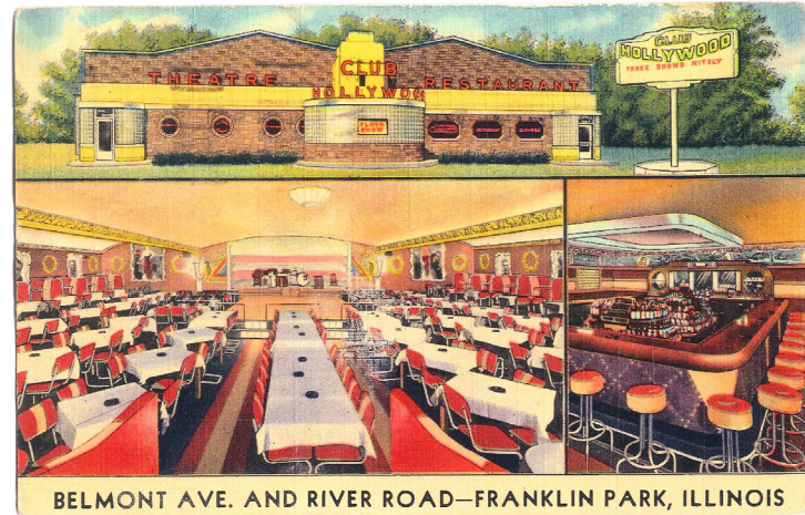
BELMONT AVE. AND RIVER ROAD—FRANKLIN PARK, ILLINOIS

Want to learn more about what is new in Franklin Park? Want an update on important Village projects? Then plan to participate in the next Telephone Town Hall scheduled for Tuesday, March 21 at 6:30 PM! If you do not receive a call from the Village at that time, you can call in toll free at 847-400-0841. Participants will be able to ask Mayor Pedersen questions and also participate in survey questions.