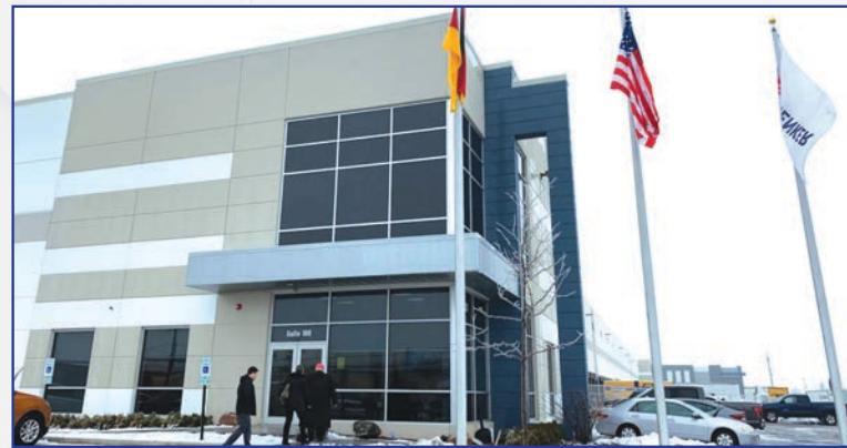
DB Schenker has moved into their new facility located at 10501 Seymour Avenue. The company is one of the largest integrated logistics Service Providers in the United States. Welcome to Franklin Park!