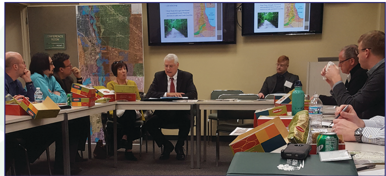
▲ The Coalition is comprised of local municipalities, the Cook County Forest Preserve District and other organizations, who are working to provide improvements and access to the trail.