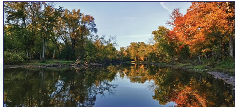
▲ Mayor Barrett Pedersen presented at the kick-off meeting of the Des Plaines River Trail Coalition and discussed the history of the trail. French explorers named the river La Rivière des Plaines because the sycamore and red maple trees resembled the European plane tree.