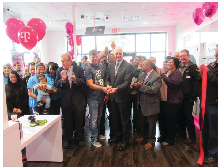
▲ Village Officials welcomed T-Mobile to their new location at Mannheim and Crown Roads, just north of Grand Avenue.