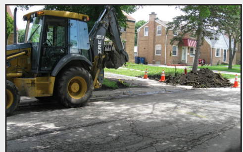
◀ NICOR replaced an old natural gas main on Westbrook.

This significant improvement is the beginning of a comprehensive multi-year program that will vastly improve our aging infrastructure; from streets, curbs and sidewalks to sewers and water lines. Soon you will be able to view the improvement plans and drawings, learn about the construction timeline and watch our progress on our website.