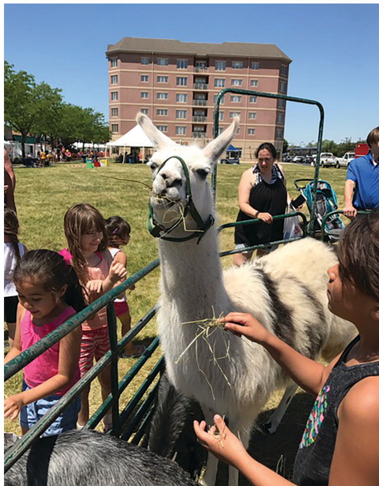
▲ Franklin Park's Family Fun Day was held during Franklin Park Fest. Area families gathered in the park to celebrate the Village's 125th anniversary and to see the trains, to play games and to enjoy the music, face painting and petting zoo.