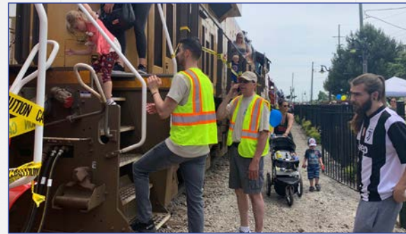
▲ Thank you to the many volunteers who helped to make our annual Railroad Day a fun and safe event for everyone!

A copy of our annual water quality report is now available on-line. This report contains important information about the source and quality of your drinking water during 2018. Go to http://www.villageoffranklinpark.com/assets/1/7/FRANKLIN_PARK_Water_Quality_Report_2019_English.pdf . If you would like this report in Polish, please go to http://www.villageoffranklinpark.com/assets/1/7/FRANKLIN_PARK_Water_Quality_Report_2019_polish.pdf . If you would like this report in Spanish, please go to http://www.villageoffranklinpark.com/assets/1/7/FRANKLIN_PARK_Water_Quality_Report_2019_spanish.pdf . If you would like a paper copy, call 847-671-8252 and indicate if you will pick up at Village Hall or if you would like a copy mailed to you.