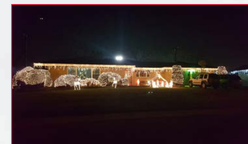
2nd Place 2724 Riverside St. Colon Family