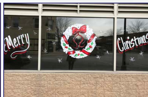
▶ Art students from Leyden High School and Hester Junior High decorated the windows at the Crossings on Franklin Avenue. Their beautiful paintings helped everyone get in the holiday spirit!