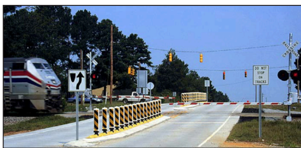
▲ An example of a channelization device proposed for use by the Citizens Advisory Board.

The Village of Franklin Park, in partnership with the Village of River Grove, is moving forward with establishing a quiet zone from the Scott Street grade crossing to Thatcher Avenue. A quiet zone is a designated section of railroad where train horns are not used. This designation requires specific steps to attain a quiet zone, including completion of safety measures mandated by the Federal Railroad Administration (FRA) to stop the requirement for trains to use their horns as they approach the grade crossings.