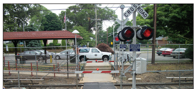
▲ The Illinois Commerce Commission has highly recommended the installation of pedestrian gates at Calwagner and would also like to see installation at Elm Street crossing.

The CAB also recommended that the option of installing additional signal gates, or quad gates at Thatcher and 25th be presented to the approving agencies should they not approve the channelization devices. The cost difference between the installation of channelization devices and quad gates is significant. The input from the CAB has been invaluable and will be used in meetings with the approving agencies.