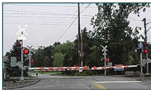
▲ This is an example of a 4 quad gate.

In 2013, the Village met with the Regional Director of the FRA, to discuss the possibility of both villages attaining a quiet zone designation. Signal improvements have begun at the Ruby Street crossing to reduce the potential for entrapment on the railroad tracks and should be completed later this year. Last October, a Citizens Advisory Board (CAB) was established to assist in developing safety measures that would best work for the Village. Additionally, the Village hired Hancock Engineering to develop the quiet zone program.