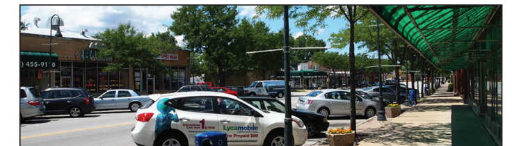
▲ The Village recently adopted new zoning regulations that will help to regulate future development in downtown Franklin Park and encourage transit friendly development around the Metra station.

Existing businesses and properties will not be affected by the new code. The updated zoning code will apply to new land uses, developments or properties undergoing substantial rehabilitation. The Village believes that this updating of the zoning code will spur development because it will streamline the business occupancy process as it accommodates for a greater range of land use types in the downtown area. The new zoning regulations will assist the Village in realizing a balanced mix of land use that is pedestrian-friendly and complementary to the character of our downtown area.