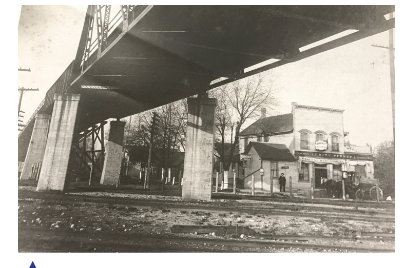
Remember this? The original Mannheim Street bridge and general store.