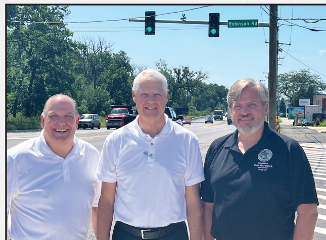
▲ Mayor Barrett Pedersen dedicated the long-awaited traffic light at River Road and Robinson Road with Representative Brad Stephens, who was instrumental in getting IDOT to install the traffic light and Senator Robert Martwick who also helped to secure the important safety measure. Area residents now have safer access into and out of the community and can avoid the dangerous experience of attempting the turn onto River Road.

◀ The Village of Franklin Park is excited to welcome Sky Café, a new dining and drinking option located at 9743 Franklin Avenue in Downtown Franklin Park! This family-owned and operated, modern gastropub features American and globally inspired flavors including soups, salads, burgers, pasta, pierogies, sandwiches, and more.