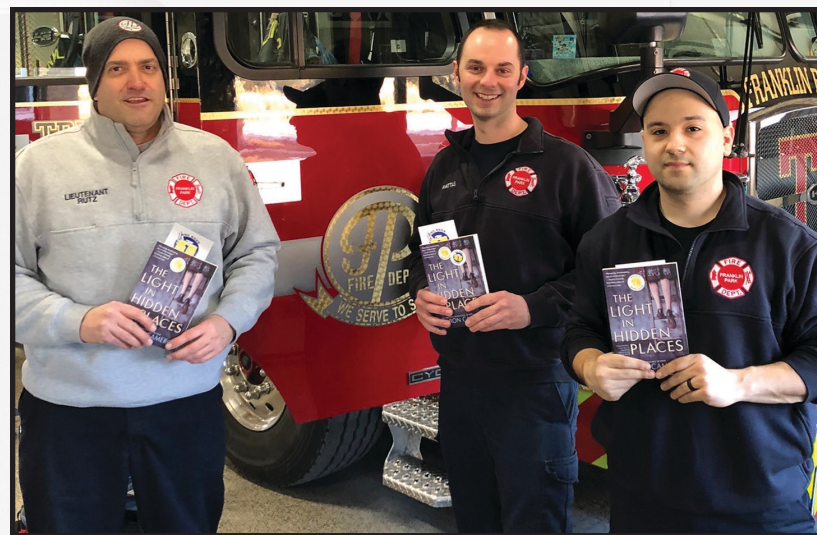
▲ Members of the Franklin Park Fire Department are reading the One Book One Leyden project's selection The Light in Hidden Places and have copies to loan out at Fire Station 2.