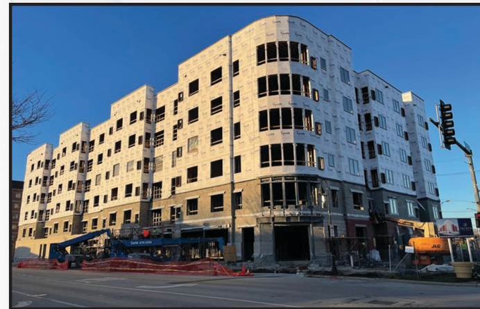
▲ Construction on Phase II of the Crossings development is continuing with the construction of a new 110 luxury unit market rate rental building at 9600 Franklin Avenue.