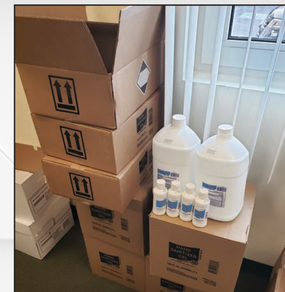
▲ Thank you to Sloan Valve and US Global Petroleum that have made contributions of products to our first responders.

These have been difficult weeks. I am so proud of Franklin Park. Our commitment to adhering to social distancing has made a difference in 'bending the curve.' I ask all our Franklin Park residents and businesses to continue to