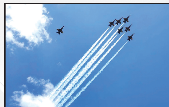
It was thrilling to see the Navy's Blue Angels fly over Franklin Park to honor the healthcare workers and first responders who have worked tirelessly during the pandemic!

The Marketplace Health Insurance Exchange (in accordance with the Affordable Care Act) in Illinois is now holding a special open enrollment period for uninsured individuals amid the spread of the novel coronavirus also known as COVID-19. If you lost your job or experienced a reduction in hours due to COVID-19 that has resulted in losing your job-based health plan, you may qualify to enroll in a Marketplace plan now. To learn more, go to www.healthcare.gov/coronavirus/ .