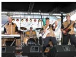
The Sting Rays

Live DJ: 5:00 - 7:00 PM Sting Rays: 7:00 - 9:00 PM