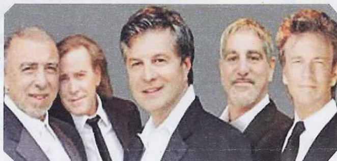
Chicago's very own, "The Buckingham" will perform at 9PM on Saturday, June 11.

Seating is available at all major attractions and areas of Railroad Daze. Visitors are encouraged to bring personal lawn chairs and folding chairs as well. During Railroad Daze, visitors are welcome to park at any legal parking space in a lot or on the street anywhere in the Village. Parking for the disabled is available at the Franklin Park Post Office located at 9760 Franklin Avenue.