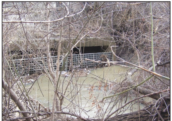
Silver Creek, south of Armitage Avenue in Melrose Park