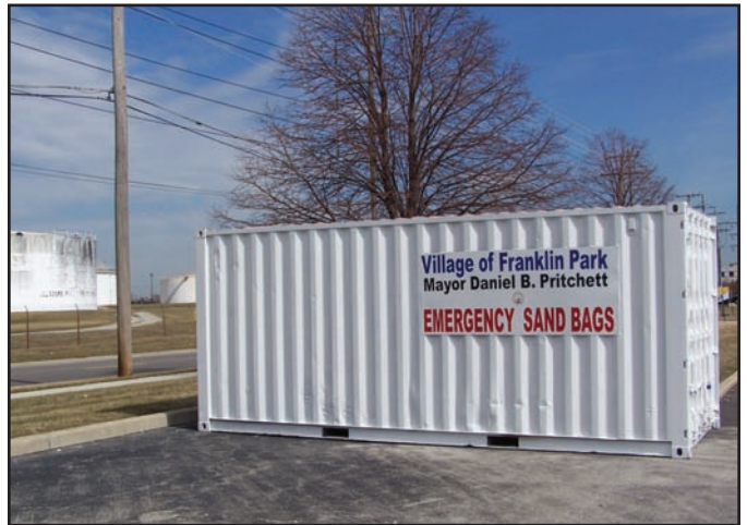
New sandbag storage container, located at Lee & Belmont