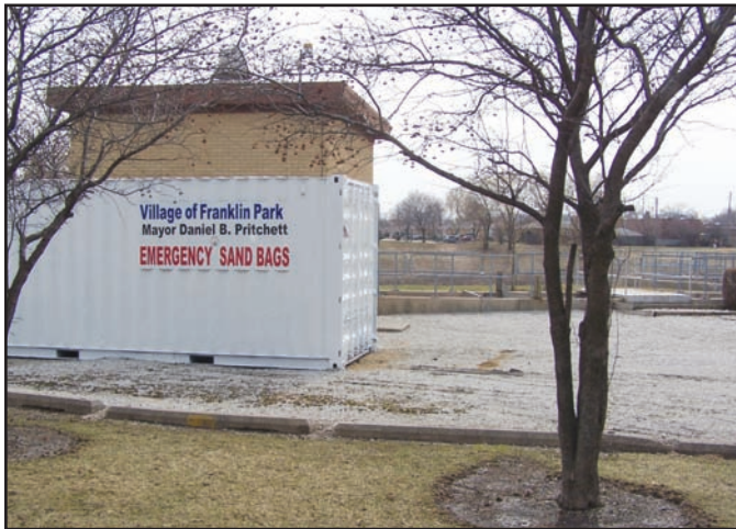
New sandbag storage container, located adjacent to the Jack B. Williams Reservoir pumping station

Construction will soon begin on the next phase of the Crystal Creek project. Currently in design, this new phase includes the removal of the Schiller Park "restrictor" near the Tollway Oasis, and the construction of an actual channel along Panoramic Drive.