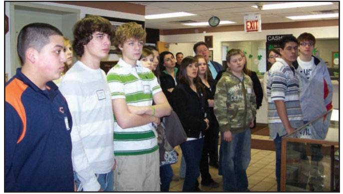
Students viewing portraits of Franklin Park Mayors