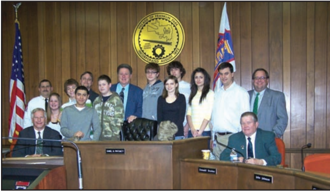
Leyden students during a simulated Board Meeting