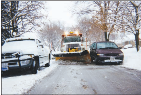
Village snowplow unable to squeeze between two cars