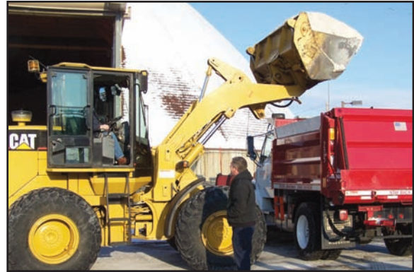
A bulldozer loading salt onto a Village snowplow