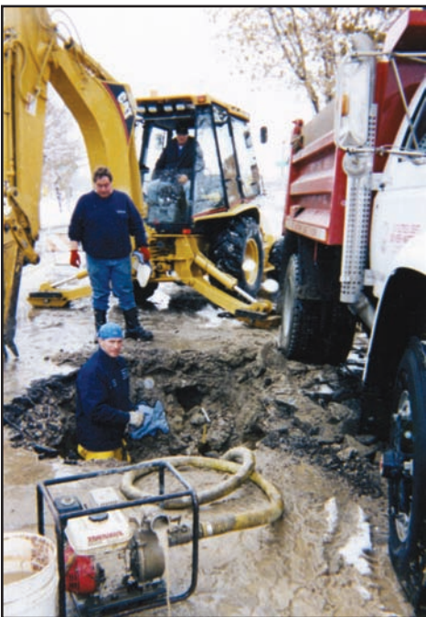
Utilities Crew fixing a water main break

The weather has again been the issue exhausting the most Village resources this winter. The final month of 2008 was recorded as having the most precipitation (snow and rain) that the month of December has ever seen. The nationally televised Bears/Packers game of Monday, December 22nd displayed a brutal scene of fridity at Soldier Field. Temperatures reached 60 degrees only five days later. Rapid thawing of accumulated snow on the frozen ground and sewer openings caused water to back up into streets. Village personnel and elected officials began sandbagging operations, but the rain fortunately changed back to snow in a short span of time.