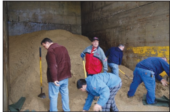
Volunteers loading sandbags