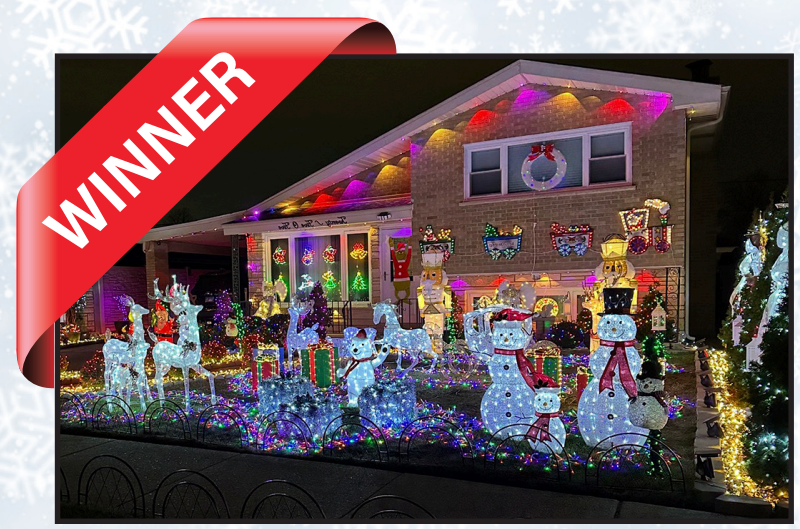
The Legaspi Family 2505 Ernst Street