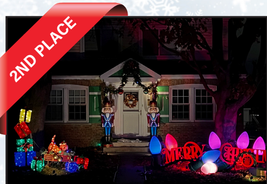
The Peacock / Chung Family 2707 Elder Lane