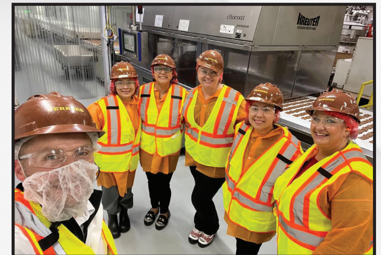
▲ Village officials and staff had the opportunity to tour the Ferrero facility in Franklin Park and to get a glimpse into how the iconic Butterfinger candy bar is made!