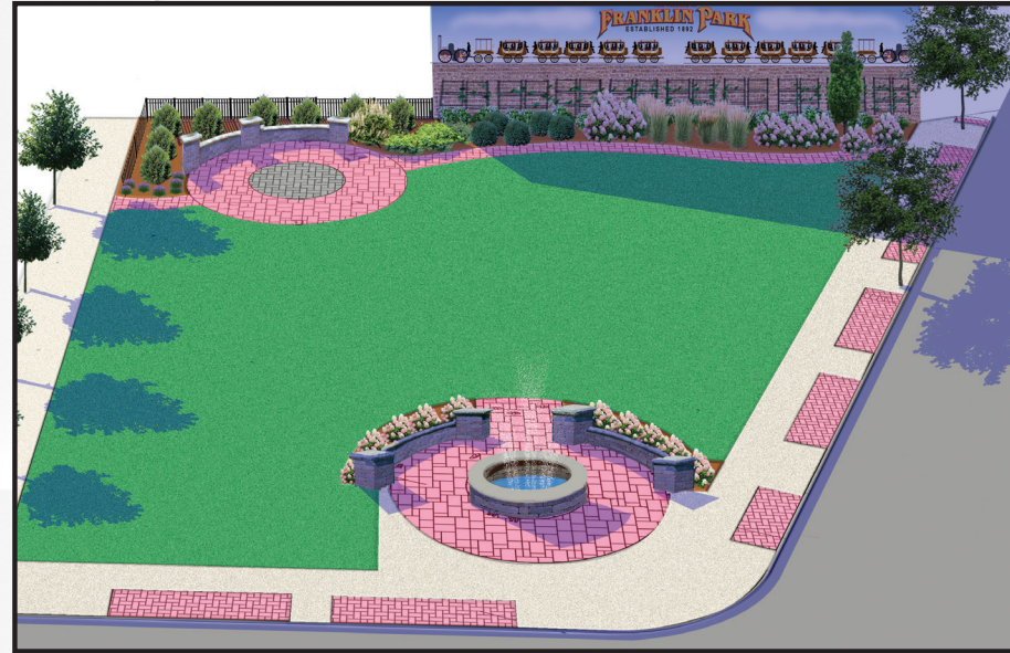
▲ Artist's rendering of the new plaza currently being constructed in downtown Franklin Park. The mural depicted is not the actual mural that will appear onsite when the plaza is completed in the spring of 2025.