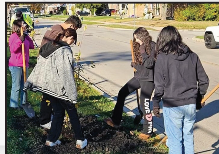
▲ Students from the Leyden High School Science Club planted 19 donated trees from the Morton Arboretum on the 9600 block of Addison.

Leyden Family Services will be at Village Hall on Wednesday, December 18 from 9 AM until Noon to help residents who have questions or need help applying for government programs including Medicare, Medicaid, and LIHEAP. Staff can also help with understanding medical bills, prescription assistance, and more. Bring your Social Security award letter and paycheck stubs that show the amount of income you receive. No appointment is necessary.