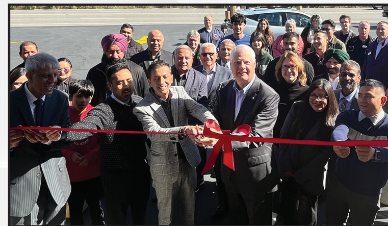
▲ Village officials cut the ribbon for Maharaj Restaurant and Banquets located at 3400 River Road. Welcome to our community!