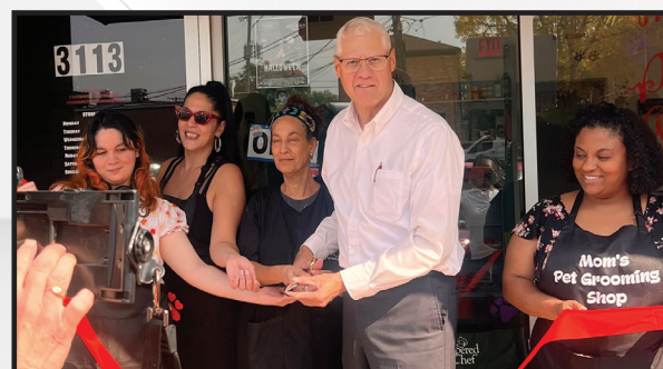
The Village was happy to recently welcome Mom's Pet Grooming Shop located at 3113 Calwagner Street.