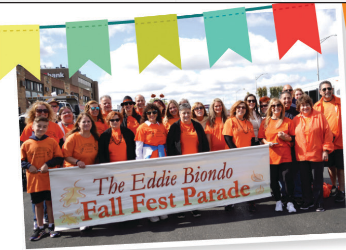
Mayor Barrett F. Pedersen

The County is able to provide funding for the Climate Resiliency for Communities Program through the American Rescue Plan Act (ARPA). The County allocated over $100 million in ARPA funding to support a clean environment for all and to fight climate change.