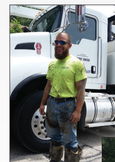
Public Works staff shows that cleaning up after big storms is a dirty job.

Our staff also walked door to door in the hardest hit areas to determine the level of damage. They advised residents to take pictures and document damage for their insurance companies. They assisted residents who had water logged furnaces or water heaters. If it was not possible to quickly dry out the equipment, they connected them to local plumbers who could provide help.