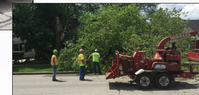
When a tree collapsed in front of the Podkul home on Hawthorne Street in May, the Village's Public Works staff and Police Department were quickly on the scene to provide assistance.

The flooding also required sanitary clean-up. Cleaning up this type of back-up is an issue of public safety. Our staff contacted a professional company that assisted residents in cleaning the damaged property to adhere to health safety requirements.